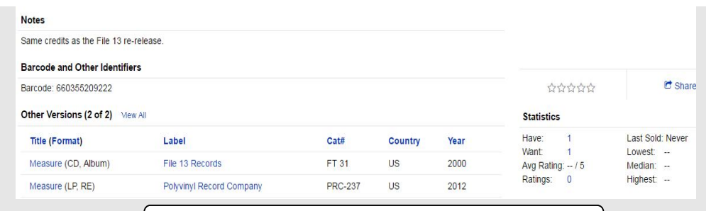
Example 1: A music album with bibliographic information