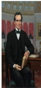
Collection of the U.S. House of Representatives About this object