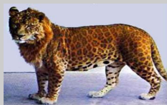
Lioness x Leopard

A leopon (pronounced: "LEP-ən") is the hybrid produced by a mating between a lioness and a leopard. The hybrid produced from the reciprocal cross (lion x leopardess) is called a lipard (pronounced: "LIP-erd").