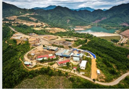
The Bong Mieu mine.

News reports from Vietnam suggest that the country's Deputy Prime Minister Truong Hoa Binh has taken to heart complaints about environmental destruction caused by illegal gold mining in the Bong Mieu area.