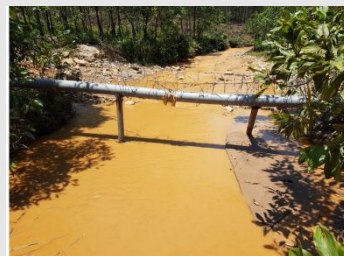
Pollution in Bong Mieu.

Police and environmental officers have raided the place several times, Dantri adds. However, as soon as they leave, artisanal miners return with pumps, wires, explosives, chemicals, crushers and set up tents in the place.