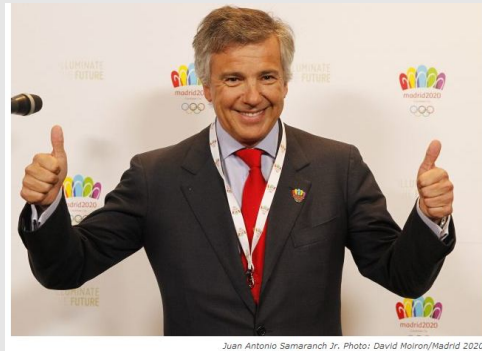
Juan Antonio Samaranch Jr.

International Olympic Committee (IOC) vice-president Juan Antonio Samaranch Jr has insisted that a joint awarding of the 2024 and 2028 Games will only take place with the full “consensus” of Los Angeles and Paris.