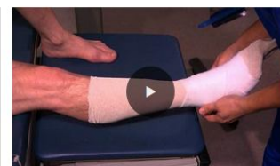
How to Apply a Sugar Tong Ankle Splint