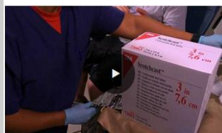
How to Apply a Long Arm Splint