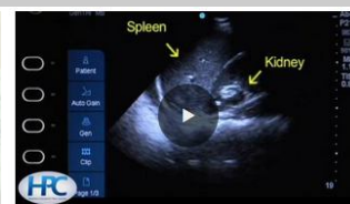
Extended Focused Assessment with Sonography in Trauma (E-FAST)