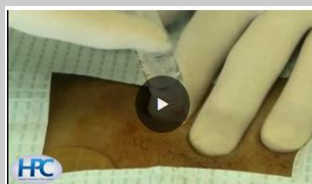
Bone Marrow Biopsy

As for example the following can be mentioned: