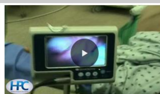
Endotracheal Intubation Using the Glidescope for Video Laryngoscopy