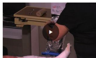
How to Apply a Posterior Ankle Splint