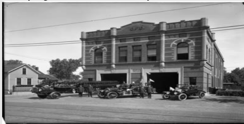
Example of Old Omaha image : Omaha Fire Department

"Old Omaha" – Some of the earliest images in the archive date to the creation of Omaha in the newly organized Nebraska Territory.