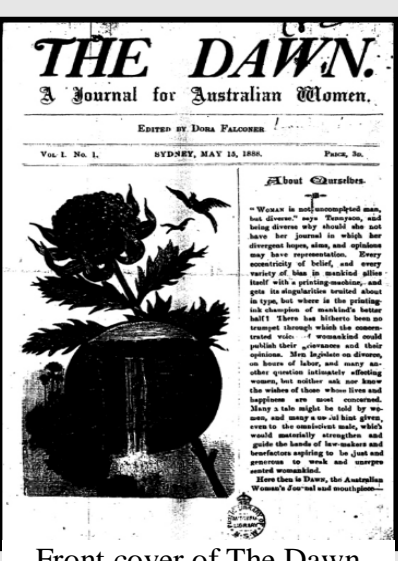
Front cover of The Dawn Issue 1, 15 May 1888. The first feminist magazine in Australia.

On 25 July 2008 the "Australian Newspapers Beta" service was released to the public as a standalone website and a year later became a fully integrated part of the newly launched Trove. The service contains over 3 million articles from 1803 onwards, with more content being added regularly. The website was the public face of the Australian Newspapers Digitization Project, a coordination of major libraries in Australia to convert historic newspapers to text-searchable digital files. The Australian Newspapers website allowed users to search the database of digitised newspapers from 1803 to 1954 which are now in the public domain. The newspapers (frequently microfiche or other photographic facsimiles) were scanned and the text from the articles has been captured