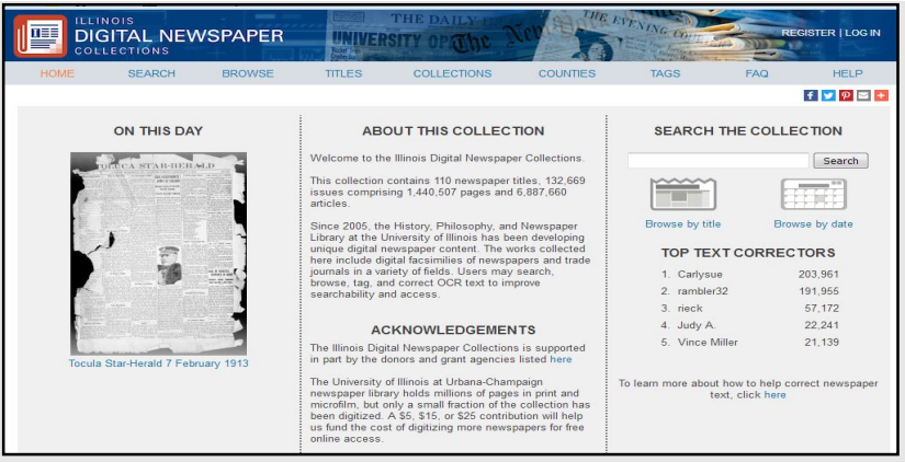
Illinois Digital Newspaper Collection Portal ( http://idnc.library.illinois.edu/)